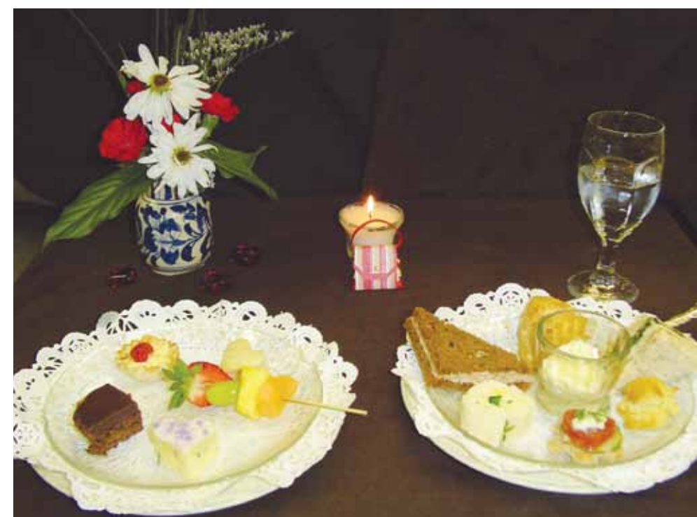
The table's all set with delicious treats for our Annual Valentine Tea. Call to make your reservation now before space fills up.

And while you're sharing the sweetest holiday with your friends and family, together you will help Albertina Kerr make a difference in our community. What's not to love?